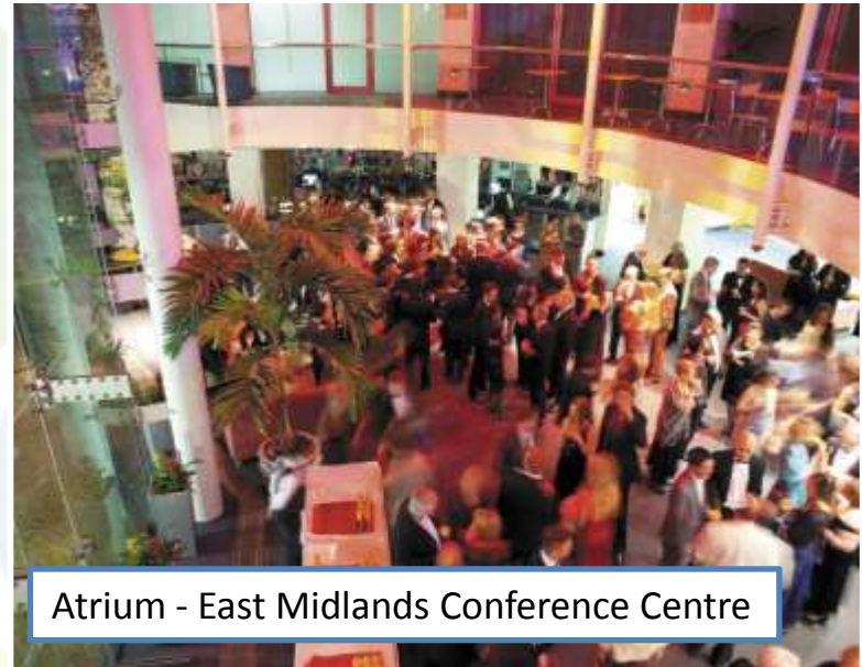
Atrium - East Midlands Conference Centre

Wakefield College Walsall Adult & Community College Wigan & Leigh College Wiltshire College Worcester College of Technology